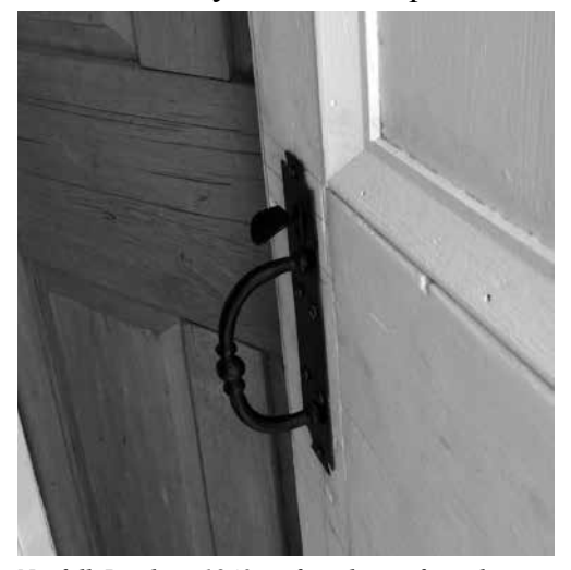
Norfolk Latch, c. 1840 on farm house front door

We also had the farmhouse driveway resurfaced, installed a liner in one chimney and made repairs to the other two. The leaky back