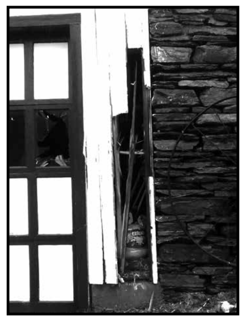
Ice House damage.

The lightning traveled underground about 50 feet under the ice house and the woodshed, breaking windows