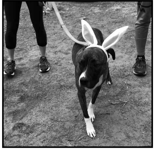
Dog-bunny is ready for the race.

we are ever grateful. This year's proceeds of $1500 set