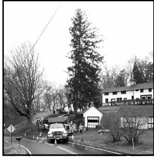
Cleanup - One tree down, one remaining.

The tree exploded with such a force that shards of splintered wood shot though the air, 300 feet