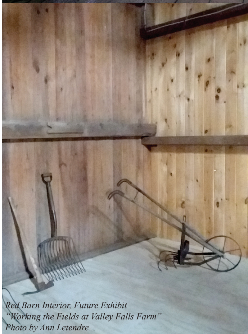
Red Barn Interior, Future Exhibit "Working the Fields at Valley Falls Farm"