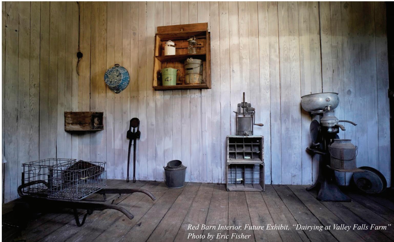
Red Barn Interior, Future Exhibit, "Dairying at Valley Falls Farm"