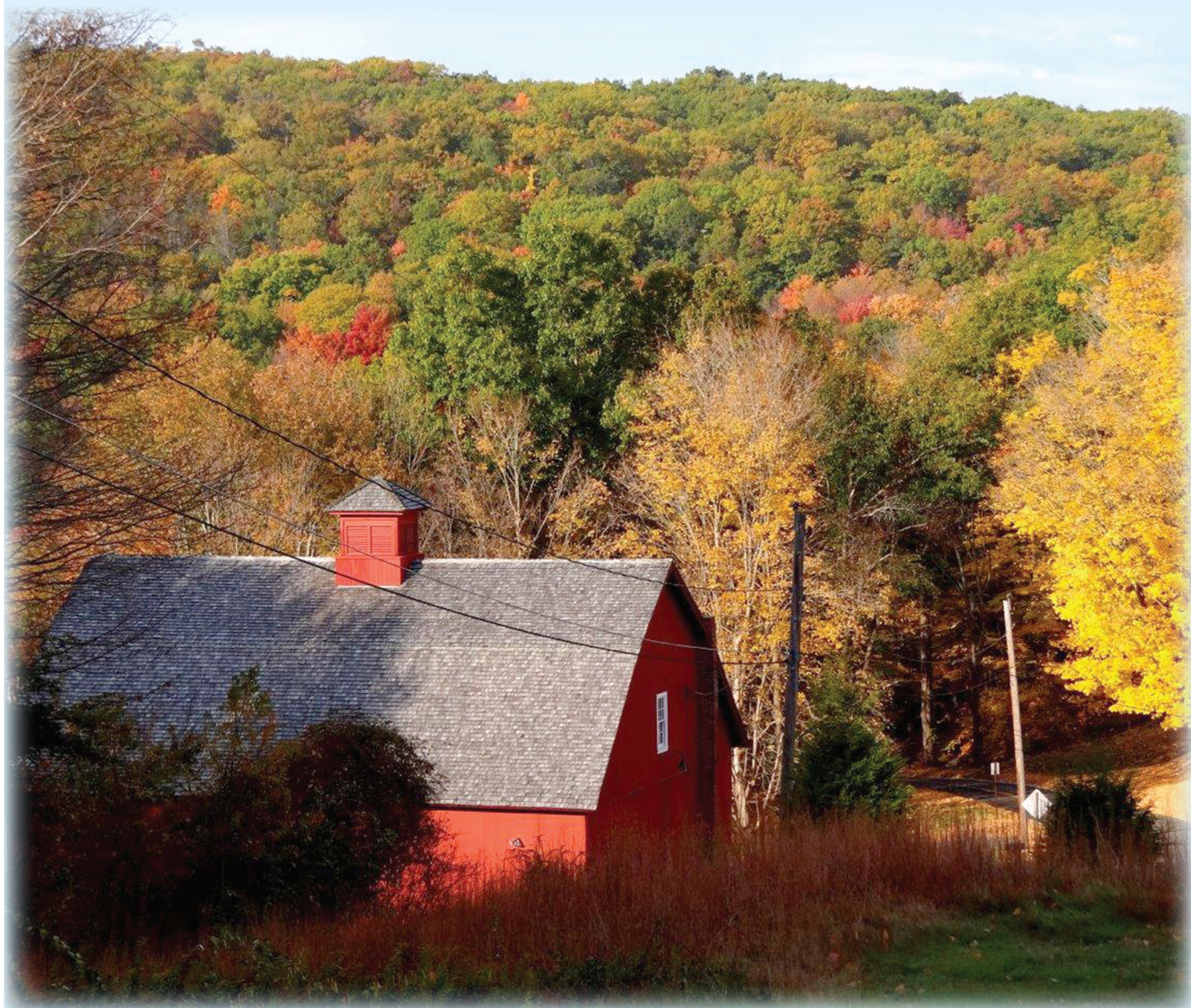
"Red Barn in Fall,"