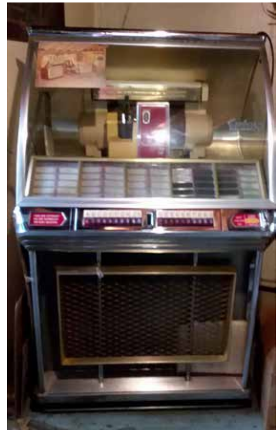
The juke box