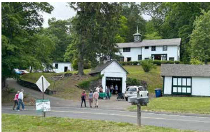
The weather was picture perfect during the last year's Heritage Center opening.

and listen to the recently-restored vintage jukebox located in the stable. Please remember that the farm is located on a hillside, so wear sturdy footwear.