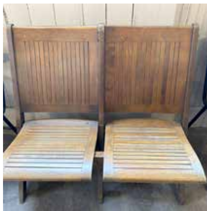
Vintage wood chairs originally donated by the Grange in 1995.

Those who have been to Valley Falls Farm and Heritage Center may have seen the beautiful wooden folding chairs we use for events. They originally came from the Vernon Grange and just recently, while